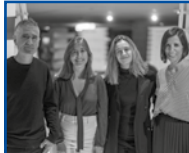
Urbanbat Resident Collective in AZ