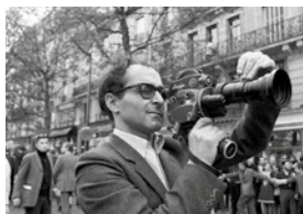
Jean-Luc Godard The art of experimentation Zinemateka