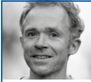
Ben Rivers Artist & Experimental filmmaker