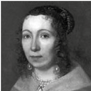
Maria Sibylla Merian Naturalist explorer & painter