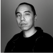
Apichatpong Weerasethakul Film director, producer & screenwriter