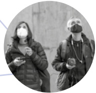
Urbanbat Office of participatory urbanism