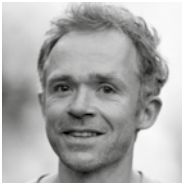
Ben Rivers Artist & Experimental filmmaker