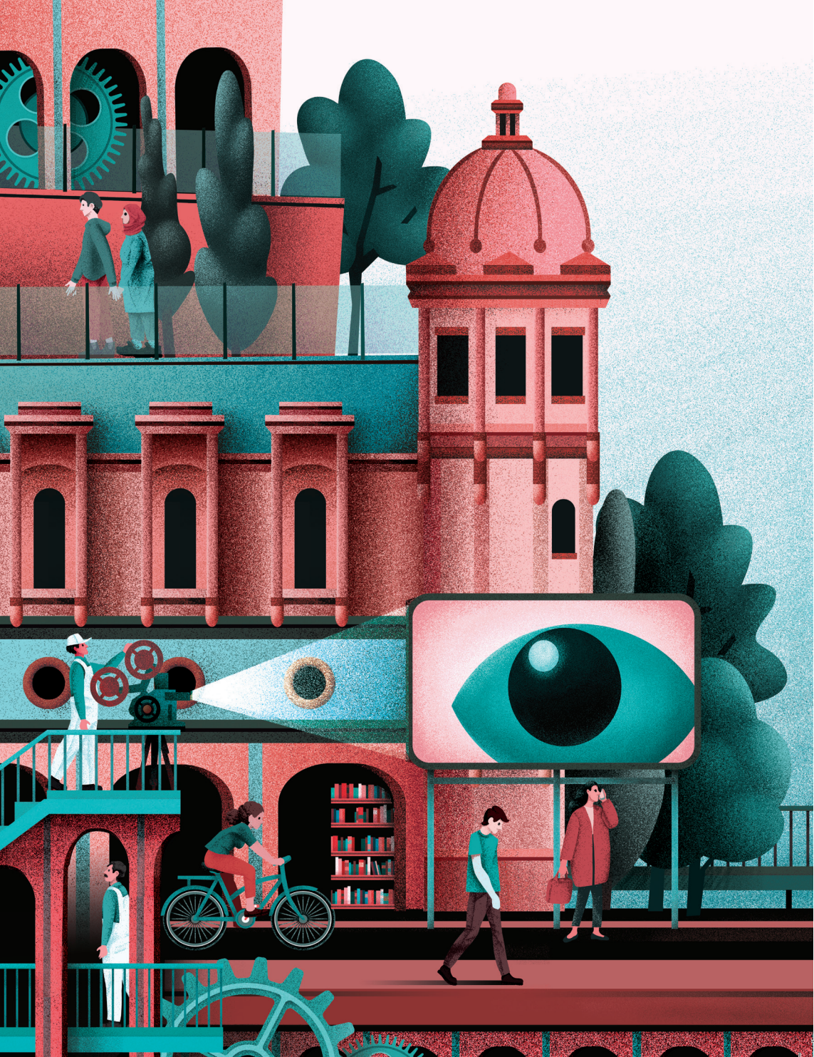
Cover image: Tomo Estudio