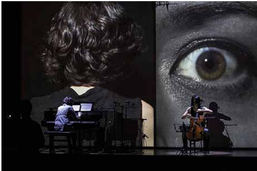
Patterns in a Chromatic Field .

Hotsetan. Experimental Music and Sound Art Programme