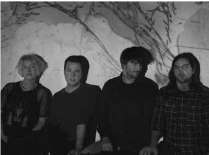
Testura.