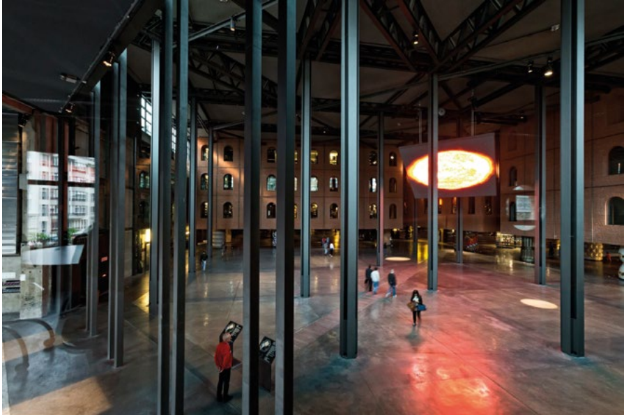
Airto de las Culturas.