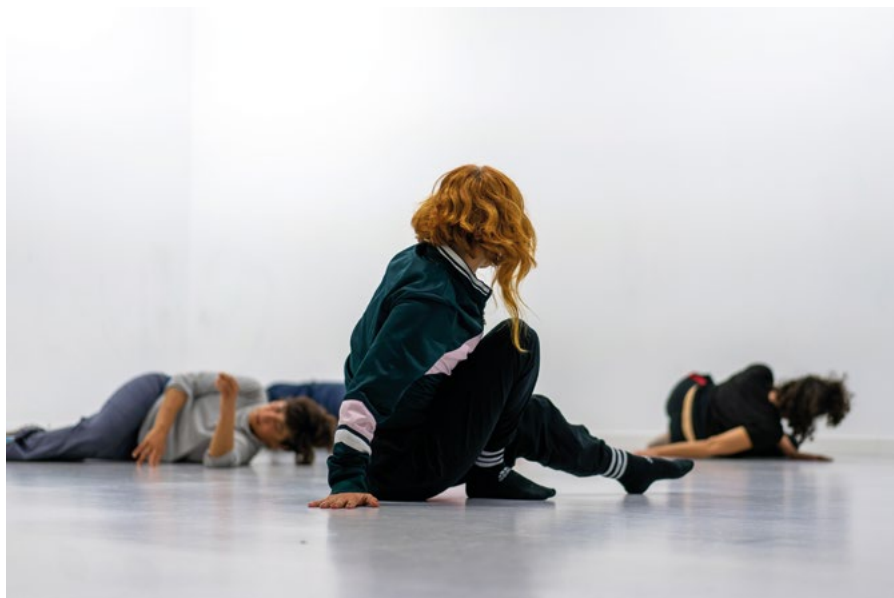
Dantzan Bilaka en Azkuna Zentroa. Febrero. 2020