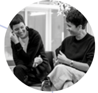
nucbeade colectivo Audiovisual artists