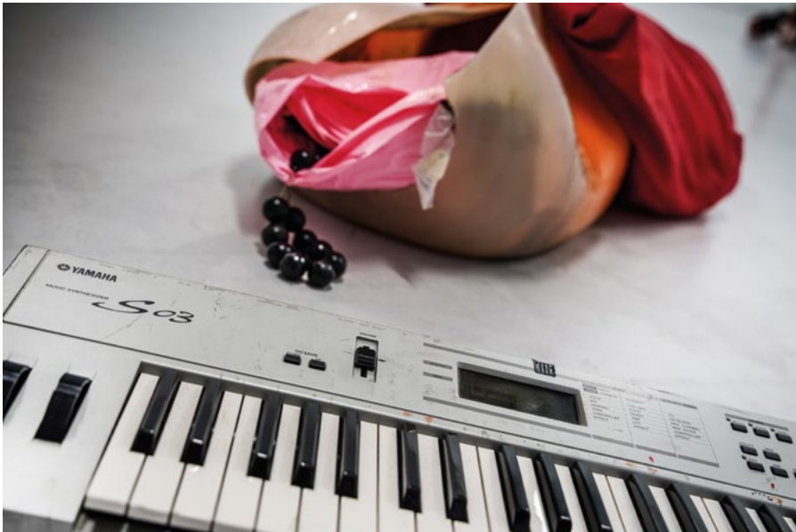
Lo adherente y el fuego

Hotsetan. Experimental Music and Sound Art Programme