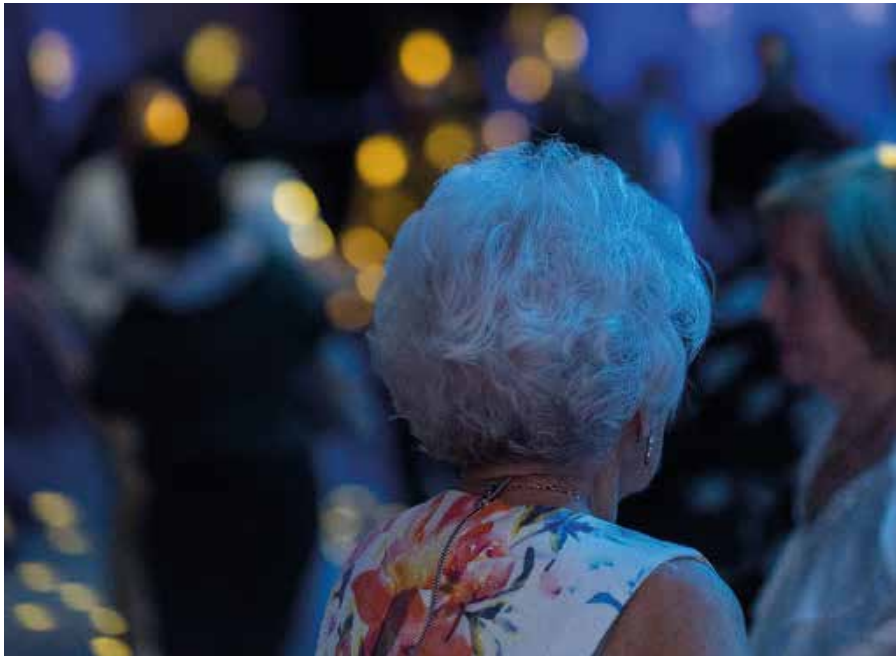
Sra. Polaroiska. No hay edad para el ritmo. Azkuna Zentroa 2019

Consejo de Sabias (Council of wise women)