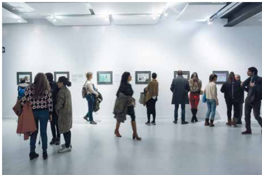
La verdadera noche